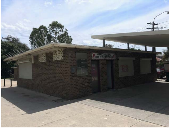
Photo 1. No hazardous building materials suspected or identified at the time of inspection.